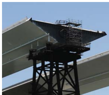
Our scales have the same orthotropic design used for many high-traffic roadway bridges.

When a highway bridge fails, the results can be catastrophic. Many bridge designers are now turning to orthotropic ribs as a better alternative to older support structures because of the proven strength, reliability, and longevity. Give your weighbridge the same durable orthotropic design that is being used for today's highway bridges. Don't let a failed weighbridge be catastrophic for your business.