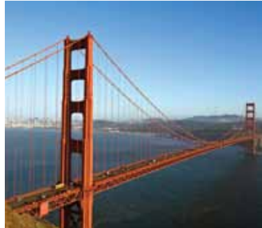
Our scales have the same orthotropic design used for the Golden Gate Bridge and many other high-traffic roadway bridges.

When a highway bridge fails, the results can be catastrophic. Many bridge designers are now turning to orthotropic ribs as a better alternative to conventional I-beam structures because of the proven strength, reliability, and longevity. They know that the strength and durability of a weighbridge has more to do with how the steel is used than with how much steel is used. Don't let a failed weighbridge be catastrophic for your business.