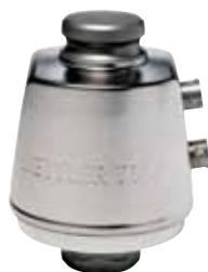
POWERCELL PDX Load Cell

Upgrade your scale to POWERCELL® PDX® technology and experience the ultimate in reliability. POWERCELL PDX load cells eliminate the need for maintenance-prone junction boxes, totalizers, and sectional controllers.