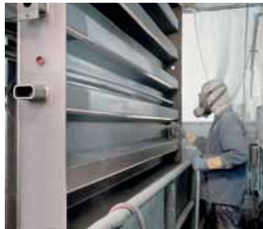
Metal surfaces are coated with a two-part epoxy finish to protect against corrosion.

The end result is a durable finish that protects against the corrosion and contaminants that can shorten the life of a scale.