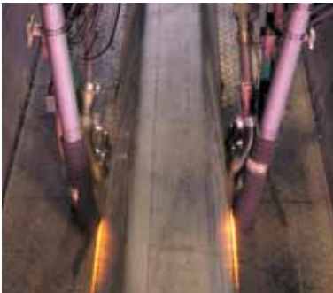
Modules are robotically welded to meet the highest quality standards.