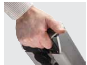
Integral Lift Handle