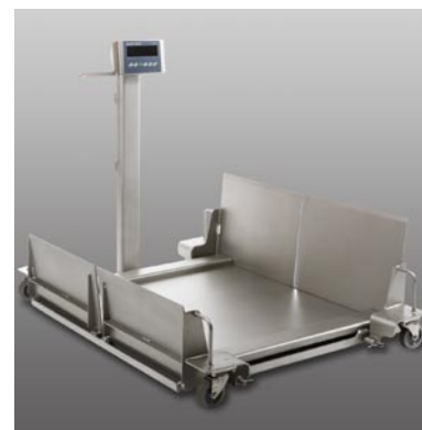
Stainless steel DECKMATE floor scale for sanitary applications.

Our load cells are approved for use in hazardous areas in most markets. DECKMATE load cells carry Factory Mutual, European Ex, and Canadian CSA Ex approvals when used with a METTLER TOLEDO intrinsically safe terminal.